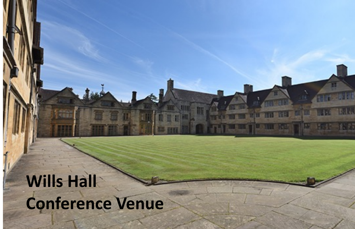
Wills Hall Conference Venue