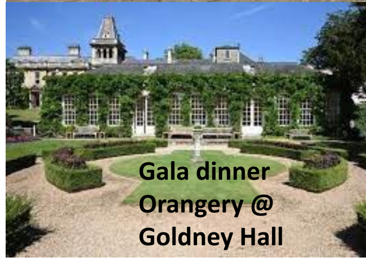
Gala dinner Orangery @ Goldney Hall