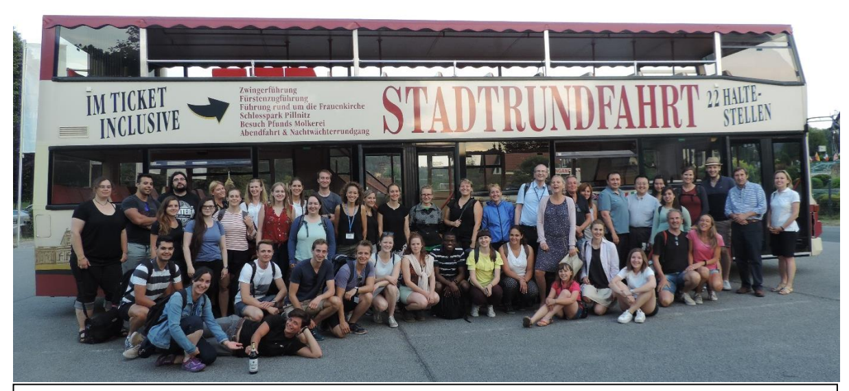
Group picture after the excursion to Saxon Switzerland national park during the 1st ESM-EVBO summer school 2018.

I would like to thank the British Microcirculation Society for their support, and for giving me this great opportunity to attend the 1<sup>st</sup> ESM-EVBO summer school in Dresden. It was a fantastic week of fruitful discussions, some new insights into the field of vascular biology and the microcirculation, and the chance to meet great early career researchers from all over Europe.