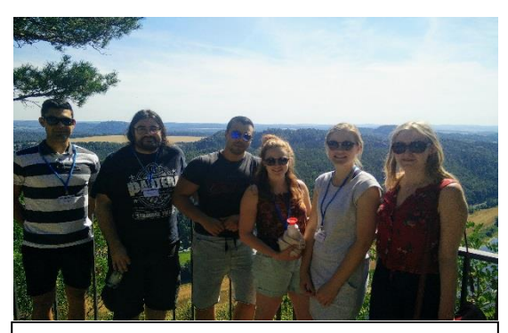
At the Bastei: Me (2<sup>nd</sup> right) with students from Hungary, Sweden, Germany, Netherlands and UK.

On Wednesday, we were all invited on a wonderful trip to the Saxon Switzerland national park to visit the Bastei (a rock formation towering 194 meters above the Elbe River in the Elbe Sandstone Mountains of Germany) and to have a lovely walk down to the river. On our way we passed a beautiful lake called Amselsee where we took the chance to refresh.