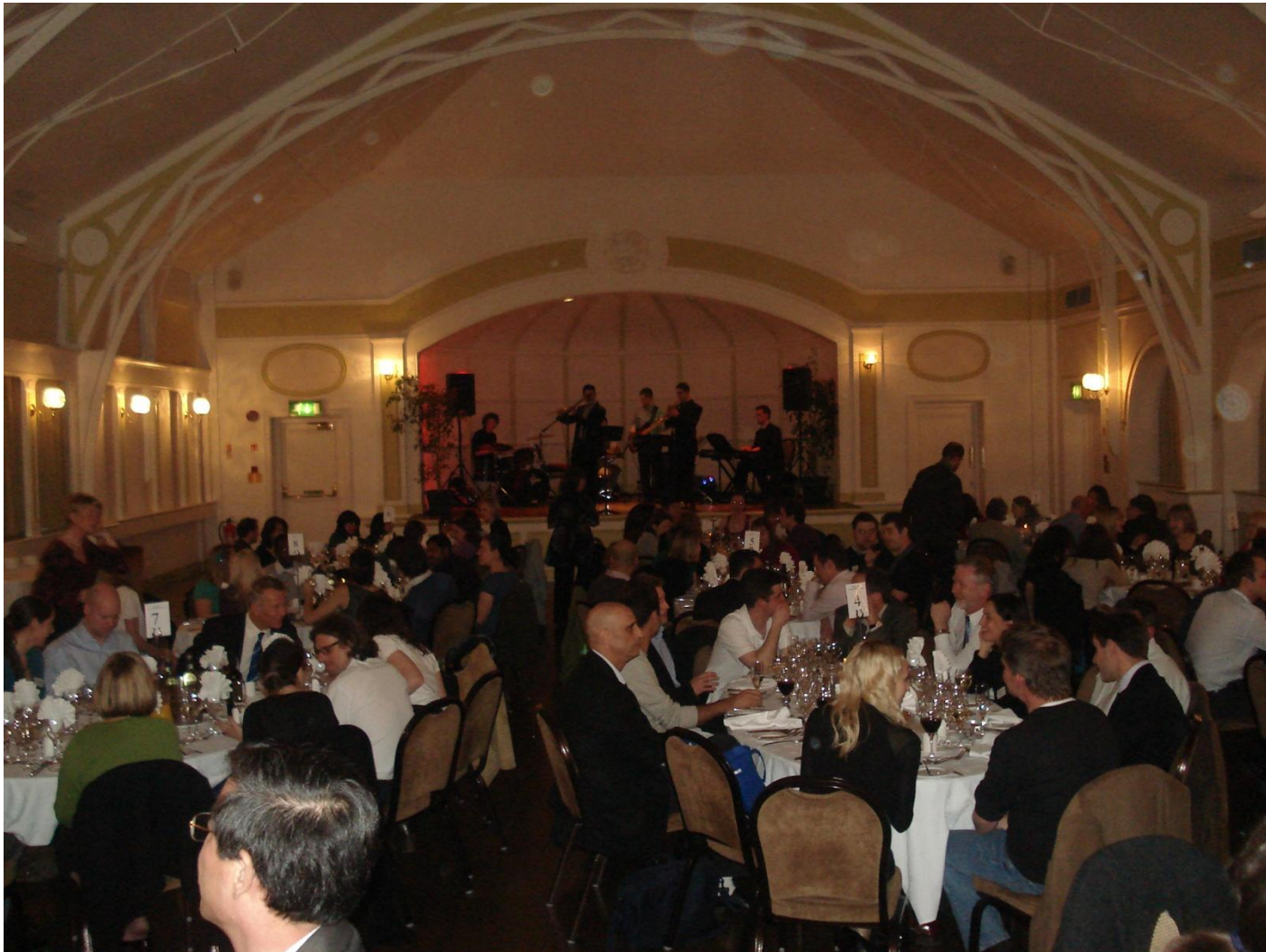
Delegates of the 59 th BMS Conference enjoy dinner, drinks and Latin Jazz at the Society Dinner held in the Botanical Gardens, Edgbaston, Birmingham, on the evening of Monday 31 st March, 2009.