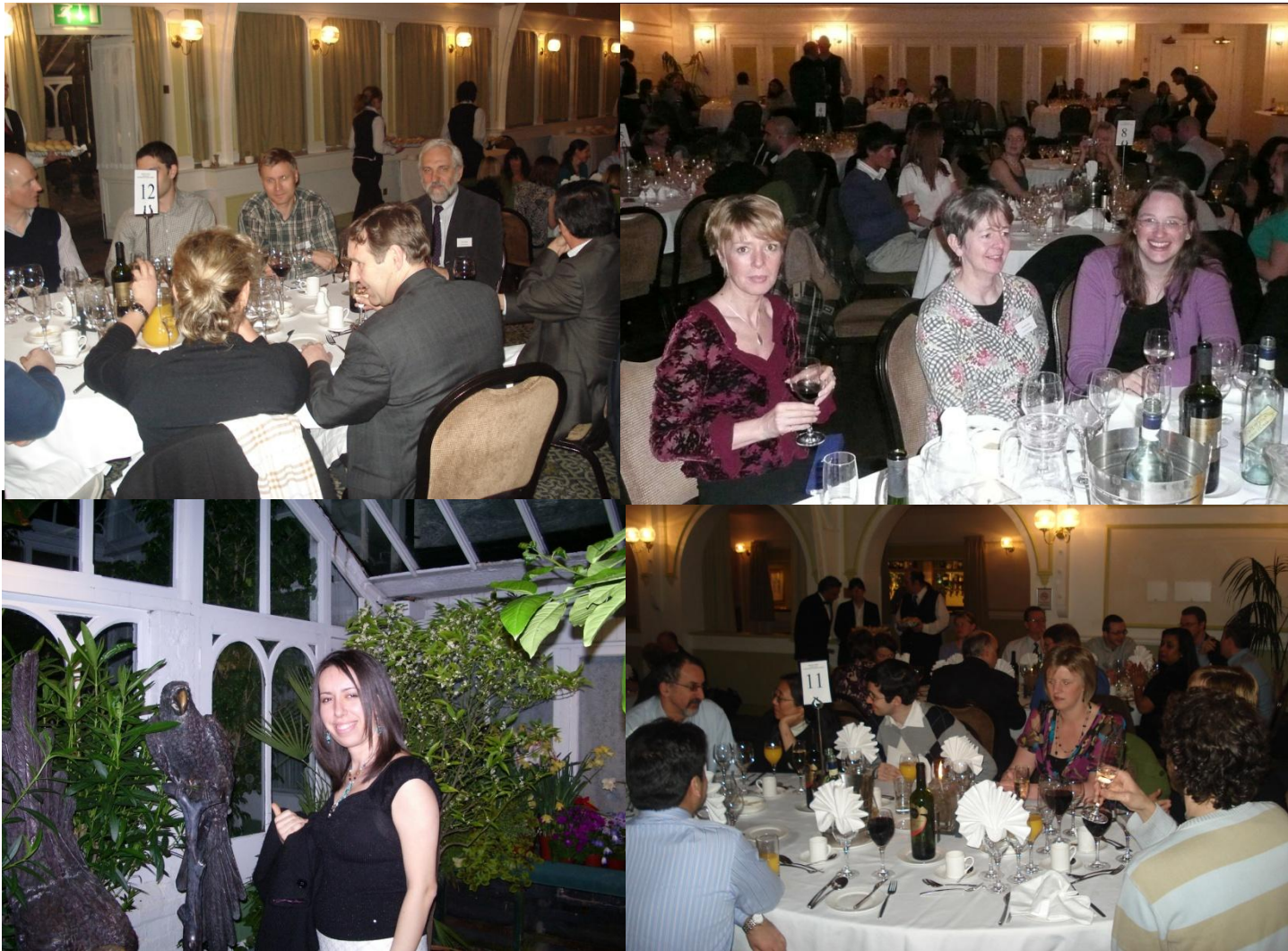
Delegates of the 59 th BMS Conference enjoy dinner, drinks and Latin Jazz at the Society Dinner held in the Botanical Gardens, Edgbaston, Birmingham, on the evening of Monday 31 st March, 2009.