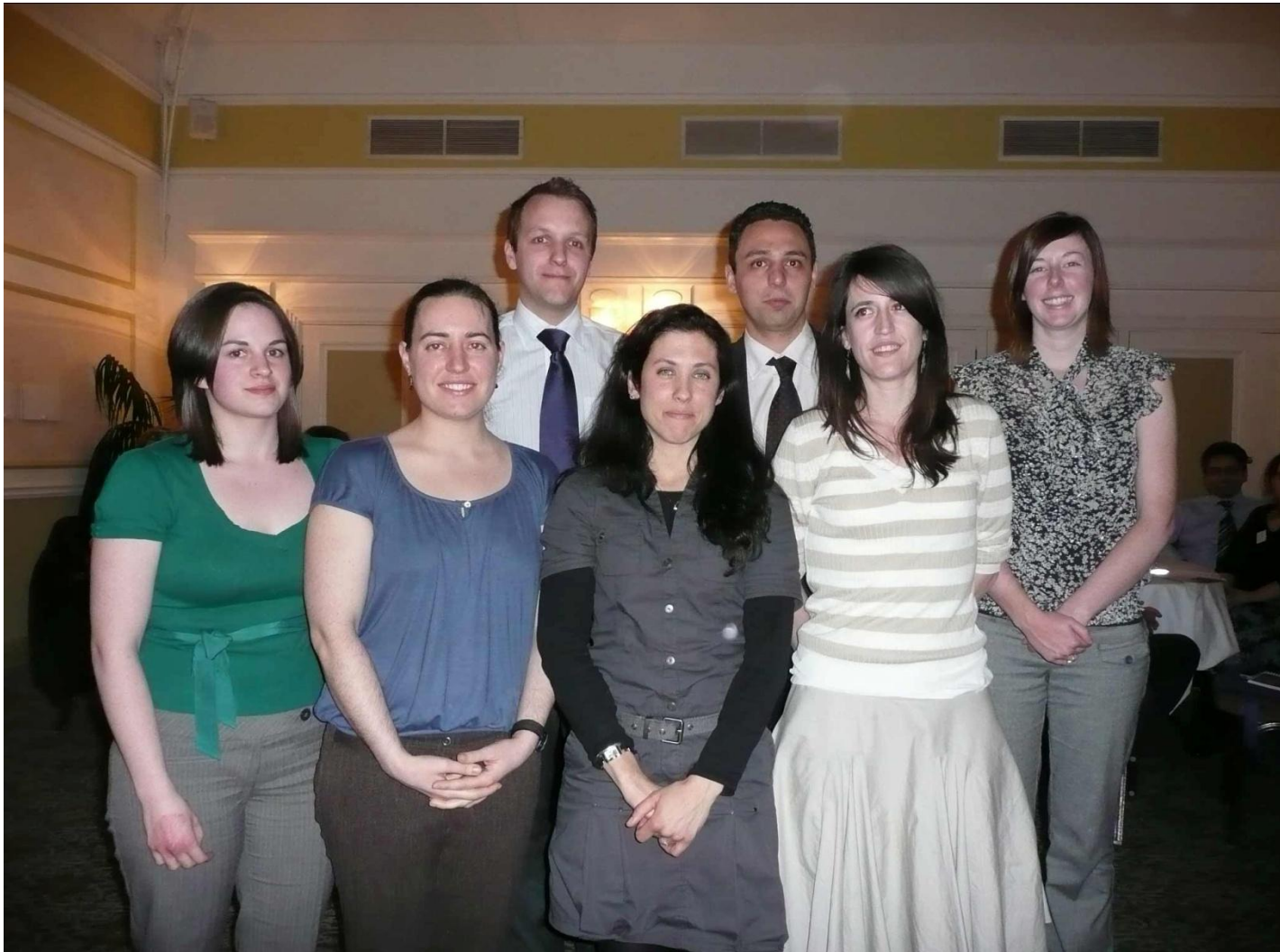
Winners of the BMS Student Assistance Scheme at the 59 th BMS Conference at the Society Dinner held in the Botanical Gardens, Birmingham, Monday 31 st March, 2009.